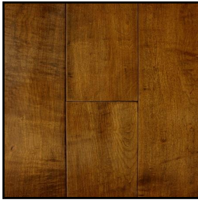
MAPLE TAWNY 9/16"x5" 29.12 SF / CTN 9/16" x 5" x RL (12"-84")