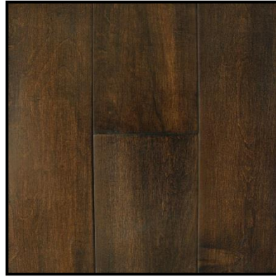
MAPLE CAPPUCCINO 9/16"x5" 29.12 SF / CTN 9/16" x 5" x RL (12"-84")