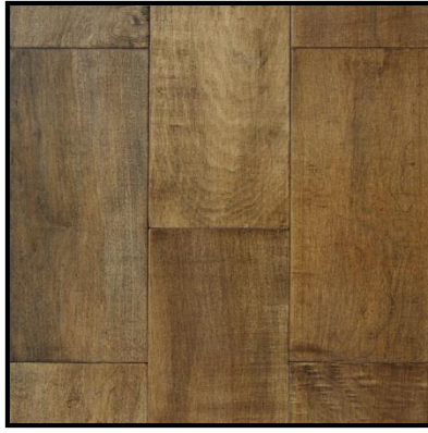
MAPLE BRONZE 9/16"x5" 29.12 SF / CTN 9/16" x 5" x RL (12"-84")