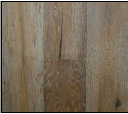
EUROPEAN OAK MARSEILLE