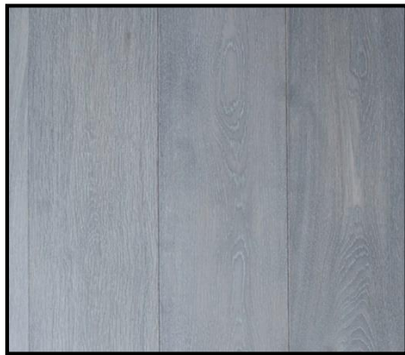
EUROPEAN OAK ARDESIA