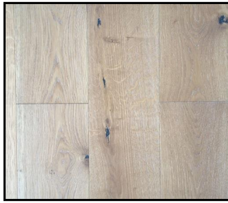
EUROPEAN OAK TOULOUSE