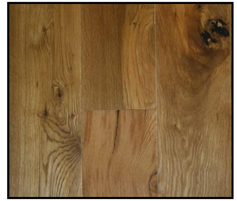
EUROPEAN OAK VALENCE