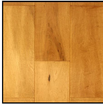
MAPLE WHEAT 9/16"x5" MHC WBM WHEAT5 29.12 SF / CTN 9/16" x 5" x RL (12"-84")