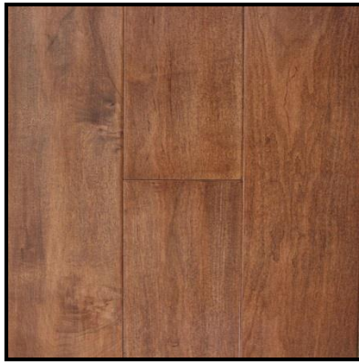
MAPLE TAWNY 9/16"x5" MHC WBM TAWNY5 29.12 SF / CTN 9/16" x 5" x RL (12"-84")