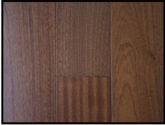
AFRICAN MAHOGANY NATURAL 5" (Smooth) 84 LBS/CTN 46.59 SQ.FT/CTN