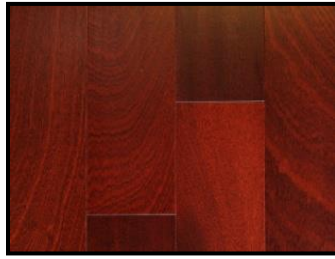
SAPELLI AFRICAN SANTOS 5" (Smooth) 84 LBS/CTN 46.59 SQ.FT/CTN