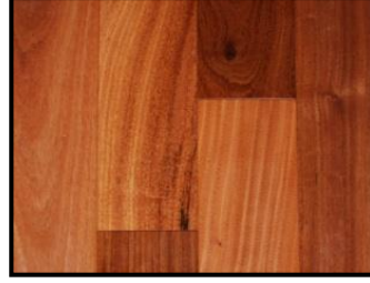
AMENDOIM NATURAL 5" (Smooth) 84 LBS/CTN 46.59 SQ.FT/CTN