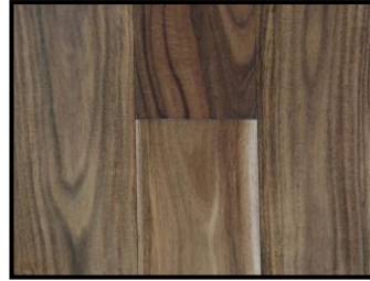
PACIFIC WALNUT NATURAL 5" (Smooth) 84 LBS/CTN 48.78 SQ.FT/CTN