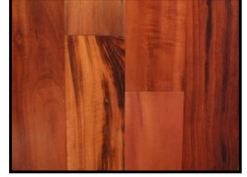
TIGERWOOD NATURAL 5" (Smooth) 84 LBS/CTN 46.59 SQ.FT/CTN