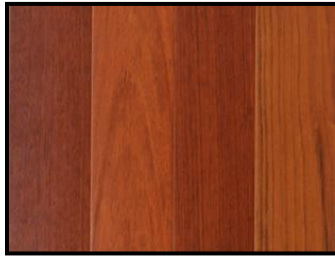
BRAZILIAN CHERRY NATURAL 5" (Smooth) 84 LBS/CTN 46.59 SQ.FT/CTN