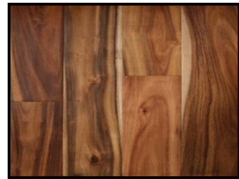
PACIFIC WALNUT JAVA 5" (Hand-Sculpted) 48 LBS/CTN 30.48 SQ.FT/CTN