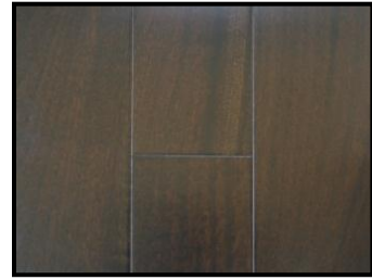
BRAZILIAN CHERRY COCOA 5" (Smooth) 84 LBS/CTN 46.59 SQ.FT/CTN